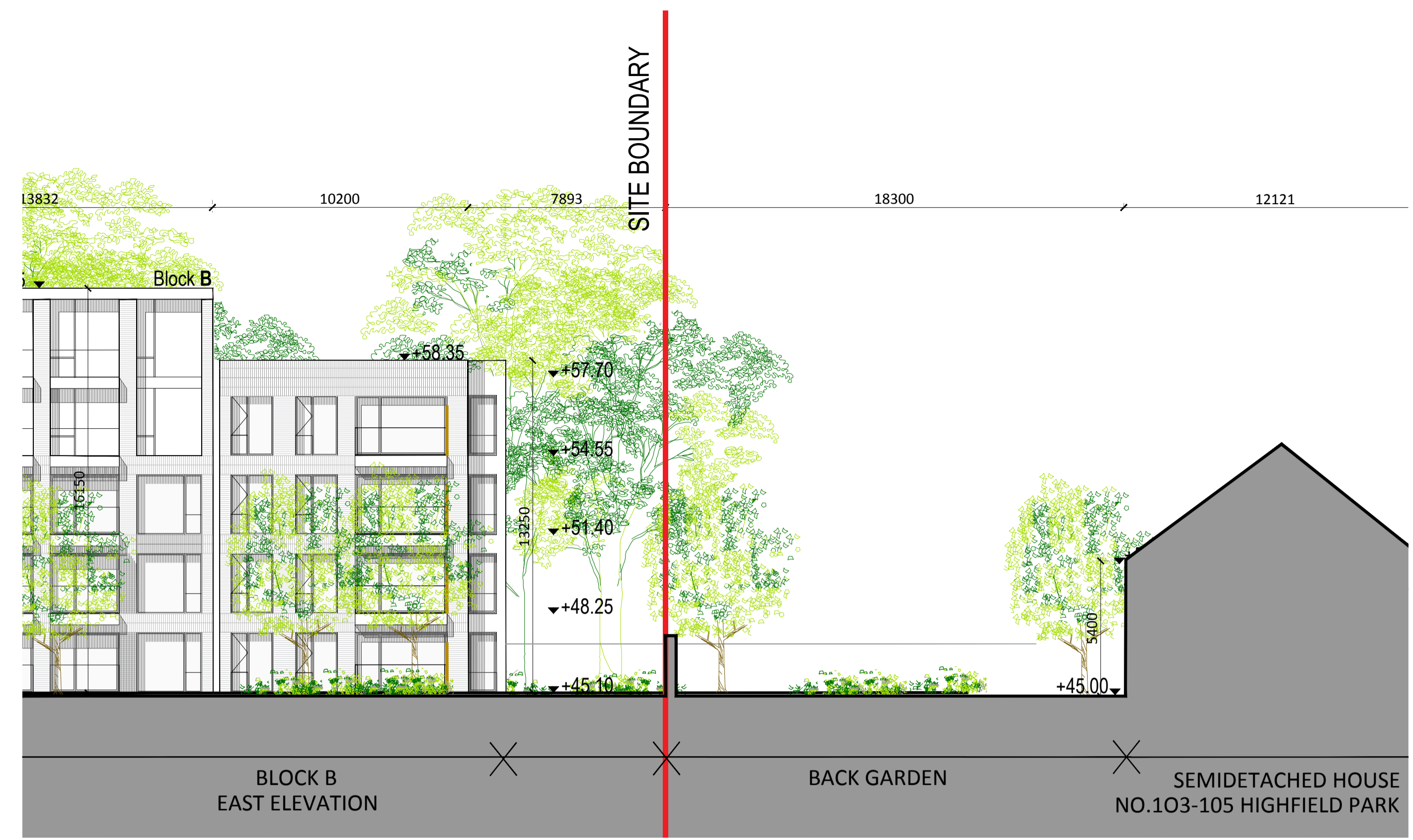
Site Elevation B-B ESC 1:200