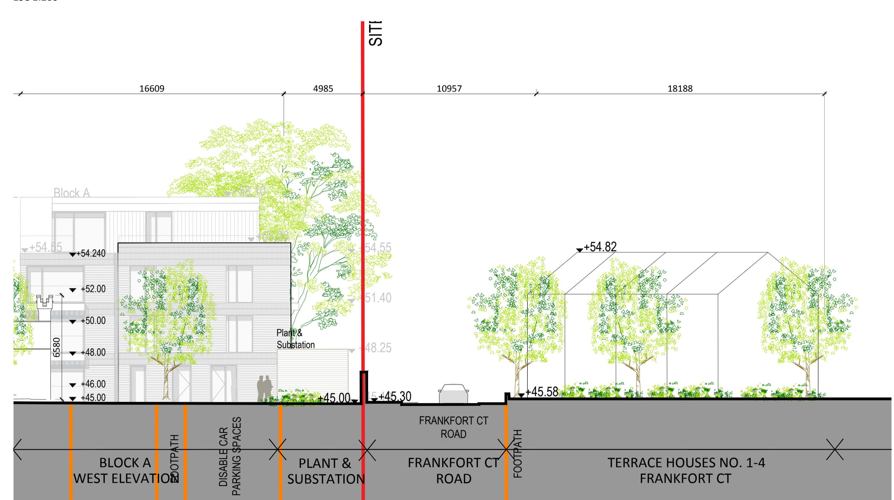
Site Elevation D-D ESC 1:200